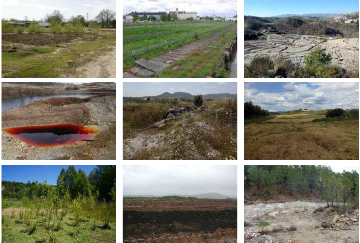
Figure 2. Pictures of sites S1-S9 (left-to-right and top-to-bottom).