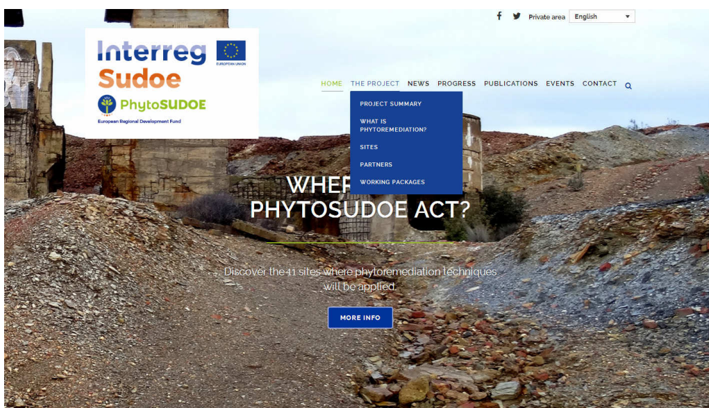
Figure 3. Webpage's Home section.